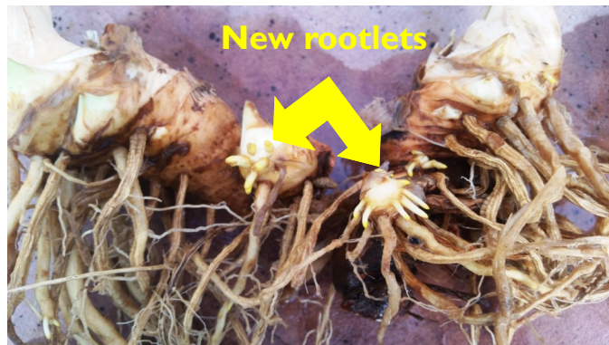
I read a tip to rehydrate rhizomes before planting, so I tried it—with these results within 48 hours.—SC